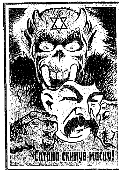
"Satan Has Taken Off His Mask"

When Hitler took power in 1933, the Nazis planned to exterminate all the Jews in Europe, beginning with those in Germany. To start, Hitler hurt the Jews economically by ordering Germans to boycott Jewish businesses. Then he took away the Jews' German citizenship and voting rights. Jewish children were turned away from public schools, too. The Nazis used propaganda such as posters, radio programs, and movies to turn ordinary Germans against their Jewish neighbors. Germans citizens responded by rioting and destroying Jewish shops, homes, and synagogues.